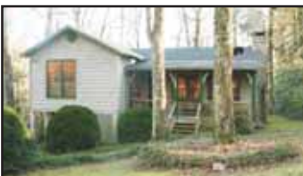
Walk to Mirror Lake from this great three bdrm/2.5 ba cottage. Wonderful deck and yard. MLS #76455 $325,000