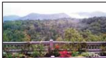
Two Custom homes on 8.5 acres in Spring Forest with fantastic views, 2 ponds, streams, walking trails. MLS#76104; $799,000!