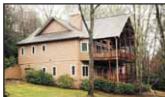
Just outside Highlands Falls CC gates, 4/5 plus office and family room, private location, granite kitchen and baths, wood floors, $647,000. MLS #