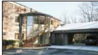
Highlands Falls CC. Architect designed for panoramic mountain views, spacious and airy, 3/3/ 2 1/2s and more. $1,350,000. MLS #76535.