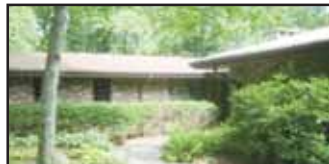
Flat Mountain Estates. 4/3 1/2 spacious home on 4.42 +/- acres (3 lots), beautiful landscaping, mature trees. $475,000. MLS #73617