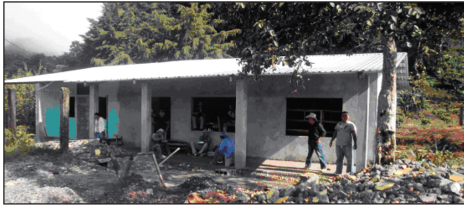
Honduras medical clinic in the works; equipment on the way.

Examples of this equipment are on display at the Highlands United Method-