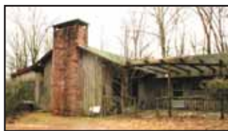
4 Minutes from Town. Charming 1940s log cabin on 2.72 +/- acres of privacy, 3/3 plus, 2 cozy lofts, spacious kitchen & sunroom. $295,000. MLS #76384