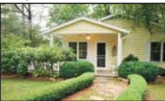
Adorable cottage located just minutes from town with 2 bdrm/2 baths and a great fenced yard. MLS# 73397. $298,000