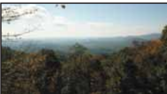
Long range, year round mountain view; 6 bdrm/5 bath. Recently reduced. MLS # 76152. $599,000