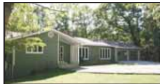
Highlands City Limits. 3/2 home with basement on 1.8+/- acres with good mountain view, level yard, two fireplaces. $359,000. MLS #65865