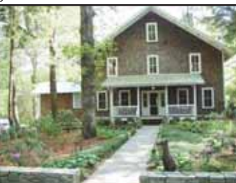
Historic home with gorgeous gardens, just 3 miles from Main Street. 5 bdrm/3 ba. MLS #76467 $1,000,000