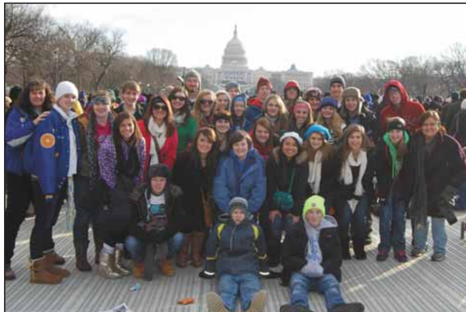
Highlands School students and staff with Capitol in the background.