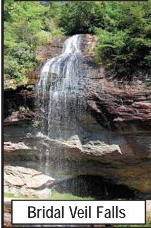
Bridal Veil Falls

Find all the waterfalls at highlandsinfo.com