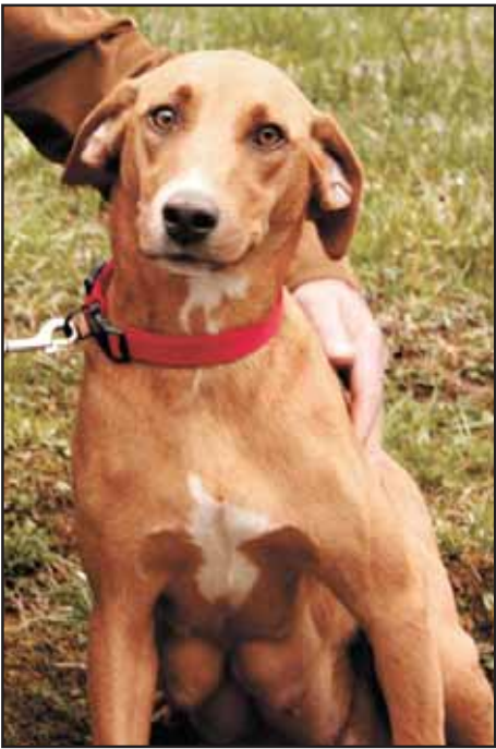
The mother of the puppies, now named April.

The public is invited to visit the shelter and help socialize the pups during shelter operation hours, Monday through Saturday, 9a-4p.