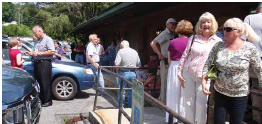
Residents turn out to hear fate of Scaly Mtn. post office.