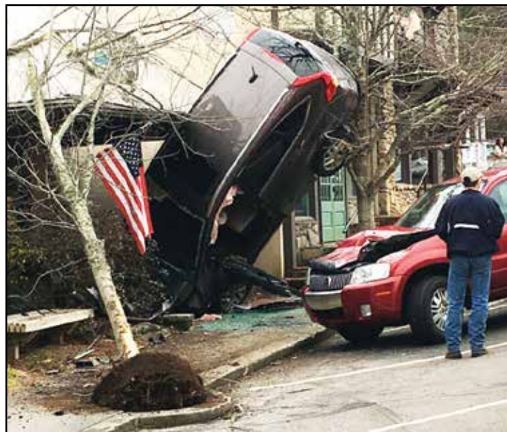
The out of control vehicle crashed into and uprooted a tree, bounced off the hood of the red vehicle, and careened into the adjacent tree before coming to a stop nose first in front of John Cleveland Realty.