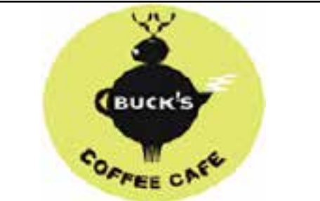
Coffee • Espresso Drinks Smoothies • Hot Soup Paninis • Baked Goods

Serving Lunch 11a to 4p Serving Dinner from 5:30p Closed Sunday for Dinner and all day Wednesday