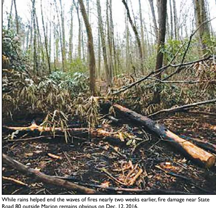
While rains helped end the waves of fires nearly two weeks earlier, fire damage near State Road 80 outside Marion remains obvious on Dec. 12, 2016.