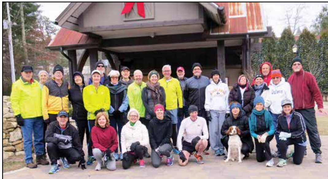
These hearty souls got a head-start on 2017 and ran New Year's Eve instead of on their usual New Year's Day.